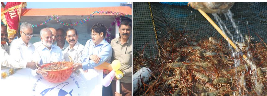
Fig. Honorable DG Dr. S. Ayyappan inaugurating the harvest of CMFRI sea cage farm at Somnath